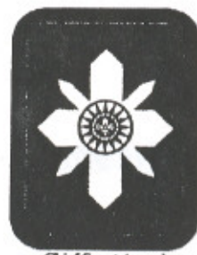
Chief Scout Award

On Friday 21 st September I travelled down to Baden Powell House in London to be presented with my county Chief Scout Award Certificate.